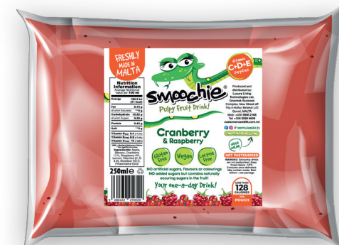
Cranberry & Raspberry 125ml, 150ml & 1000ml