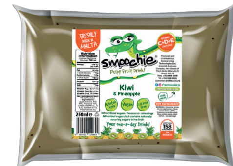
Kiwi and Pineapple 125ml, 150ml & 1000ml