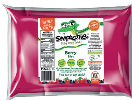
Berry Bliss 125ml, 150ml & 1000ml