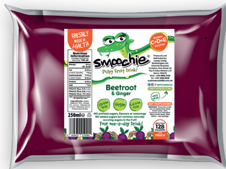
Beetroot & Ginger 125ml, 150ml & 1000ml