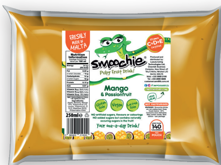
Mango & Passionfruit 125ml, 150ml & 1000ml