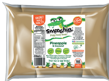
Pineapple & Coconut 125ml, 150ml & 1000ml